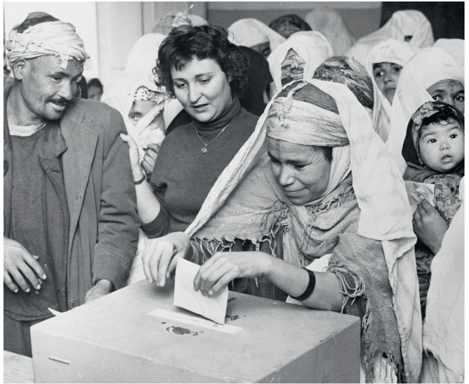
An Algerian woman votes in the 1958 election for the first National Assembly of the new French Fifth Republic