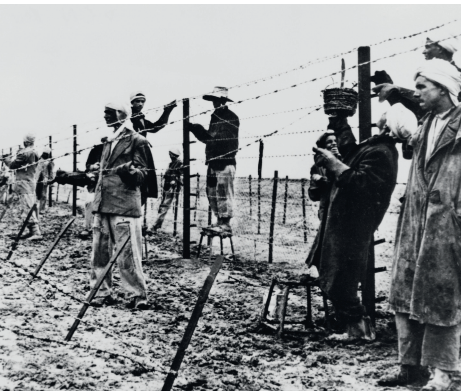
Algerian labourers building the Morice Line