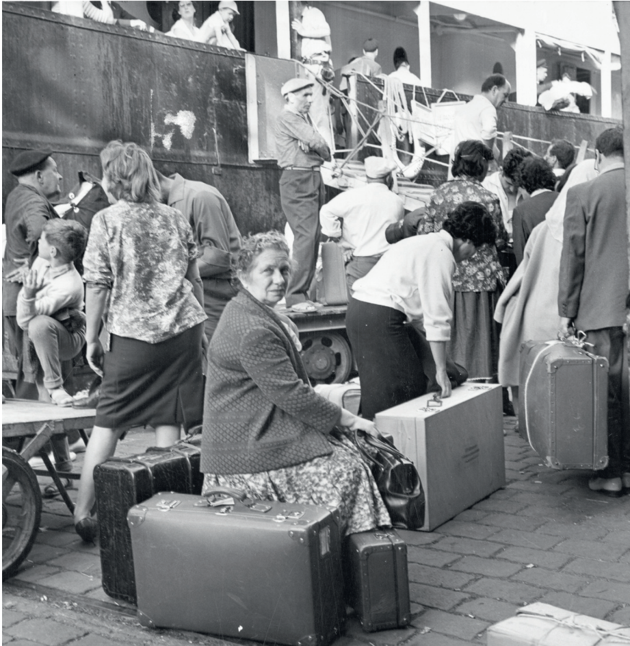
Pieds noirs leaving Algeria by boat in 1962

or police was 263,000, but when the French army withdrew in 1962, the harkis were disarmed. Many of them – and sometimes their families as well – were ‘slaughtered by FLN groups in an orgy of revenge’, according to Martin Meredith. Historians estimate the number killed at between 30,000 and 150,000.