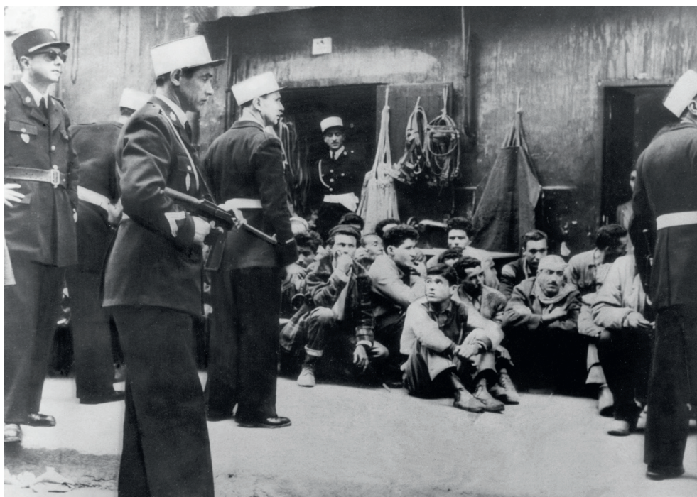
French police guarding a group of suspects in Algiers, April 1956

The Algerian War was one of extraordinary brutality, and all sides were guilty of committing atrocities. FLN guerrillas murdered French civilians and Muslims suspected of supporting them, and mutilated their bodies. French army reprisals against the Algerian civilian population were savage. The use of torture by the French army during the Battle of Algiers in 1957 provoked outrage, both internationally and at home in France. Critics likened their actions to the methods used by the Gestapo during the Nazi occupation of France. In the final stages of the war, the OAS targeted the French as well as Algerians in vicious attacks.